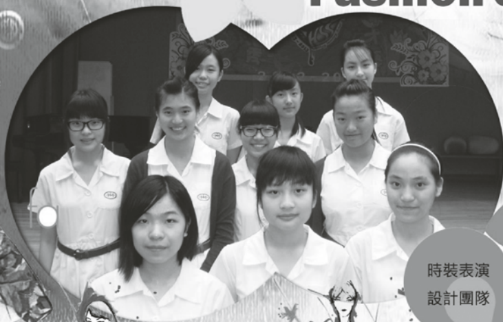
時裝表演 設計團隊